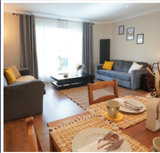
Constable Ave, London, E16