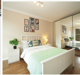
Constable Ave, London, E16