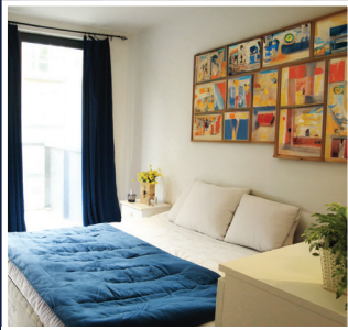
Bovet Court, London, E14